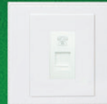
D2072 1 GANG TELEPHONE OUTLET WITH SHUTTER