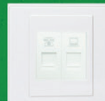
D2072/3 1 GANG TELEPHONE OUTLET + DATA OUTLET WITH SHUTTER (CAT. 5e)