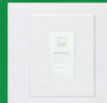
D2073 1 GANG DATA OUTLET (CAT. 5e)