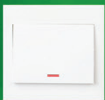
D2020 250V DOUBLE POLE SWITCH C/W NEON