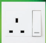
D2013 13A 250V 1 GANG SWITCHED SOCKET