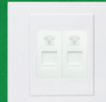
D2072/2 2 GANG TELEPHONE OUTLET WITH SHUTTER