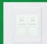
D2073/2 2 GANG DATA OUTLET (CAT. 5e)