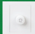
D2081 1 GANG DIMMER SWITCH (300W)