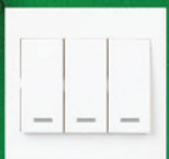
D2031 10A 250V 3 GANG 1 WAY SWITCH