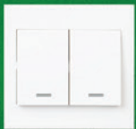
D2021 10A 250V 2 GANG 1 WAY SWITCH