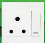
D2015 15A 250V 1 GANG SWITCHED SOCKET