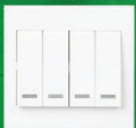
D2041 10A 250V 4 GANG 1 WAY SWITCH