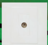
D2071 1 GANG TV OUTLET