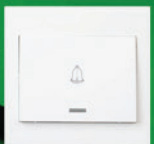
D2091 10A 250V 1 GANG BELL PUSH SWITCH