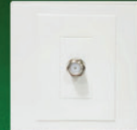
D2070 1 GANG SATELITE OUTLET (ASTRO)