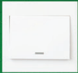
D2011 10A 250V 1 GANG 1 WAY SWITCH