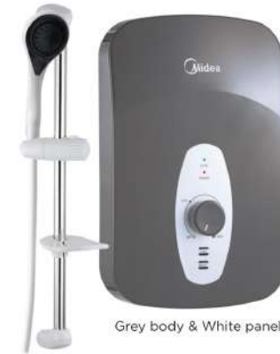
Grey body & White panel