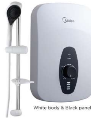
White body & Black panel